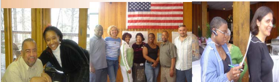
Neighborhood Leadership Academy Photos of NLA06 Class Members

Being a part of LAA/NLA exposed me to a higher level of community involvement.