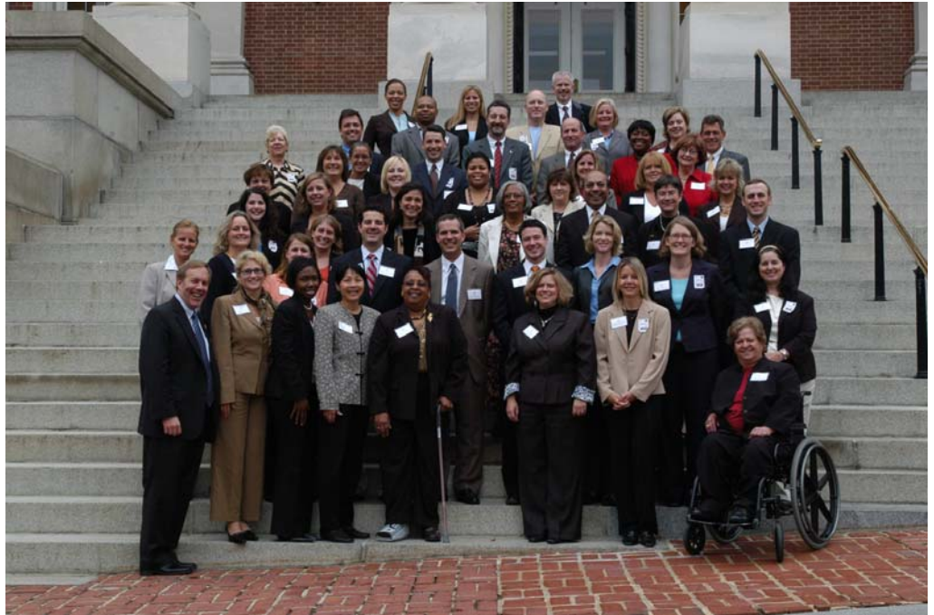
The Flagship Class of 2007 on the steps of the State House.