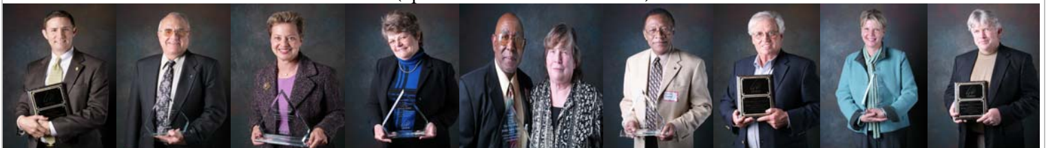
Winners of the 2006 Community Trustee Awards